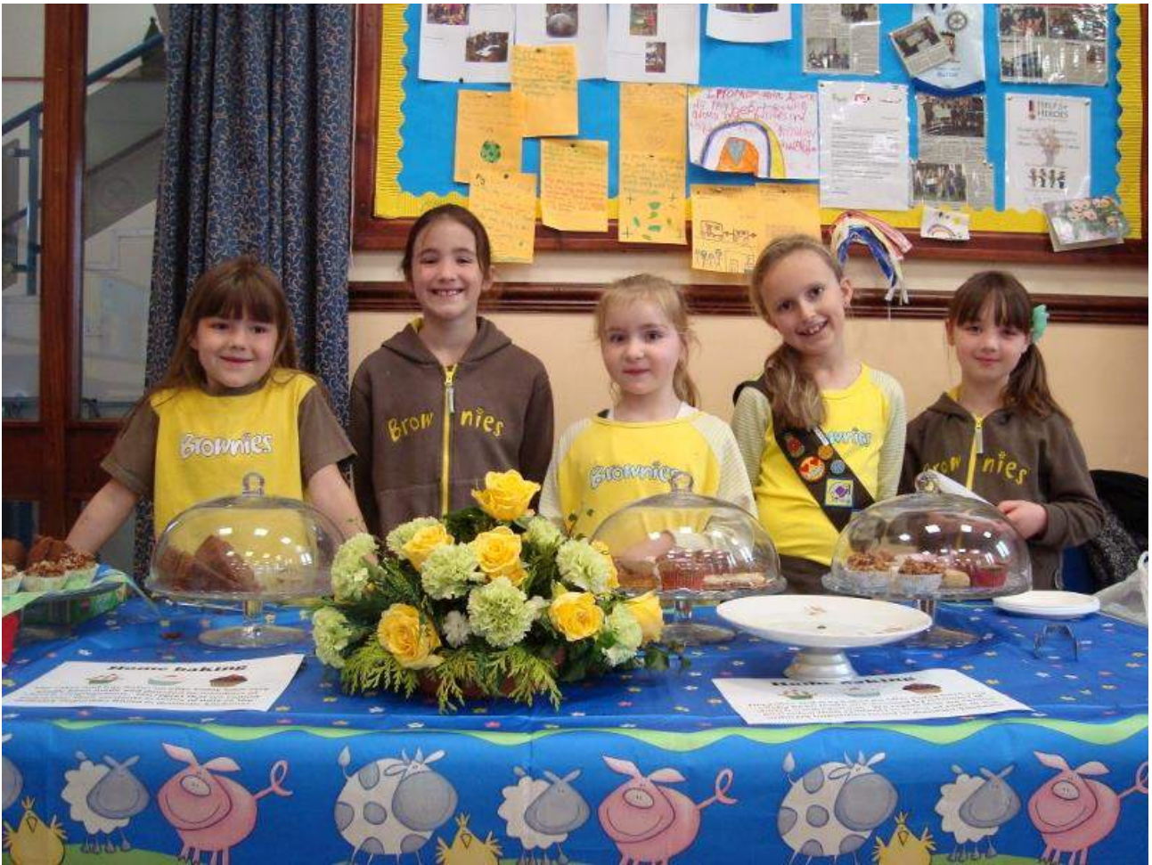
Brownies helped to serve cakes with a smile at the Spring Fair