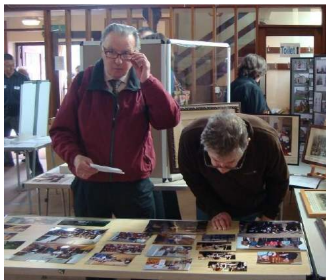
Studying Old Photographs