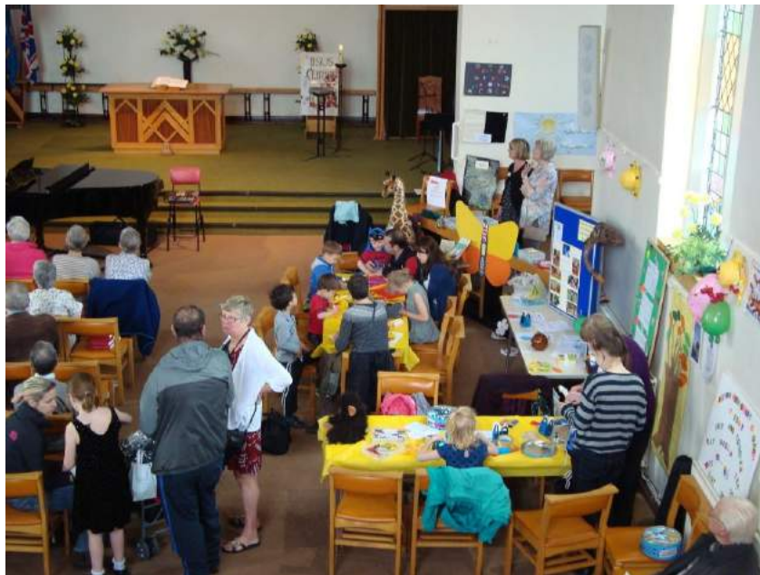
Craft Area- from the Gallery