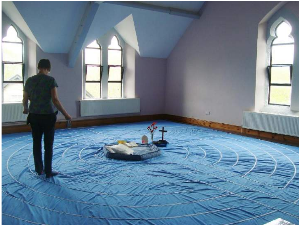
Ruth and the Labyrinth in the Upper Room

Buxton Methodist Church played host to a full day of activities organised by Churches Together in Buxton: children's crafts and storytelling, musical performances (and poetry) on the hour and more, fantastic free refreshments, a quiet zone with labyrinth and prayer stations, an exhibition of historic church photographs and a rolling slideshow of images of life in the 17 member churches and organisations today.