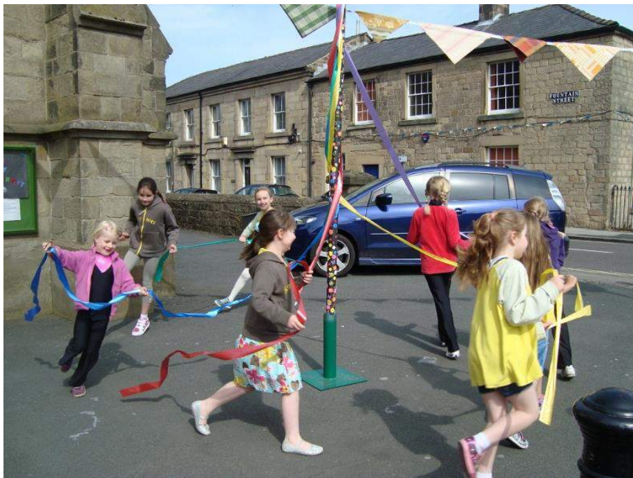
Dancing round the Maypole at the Spring Fair